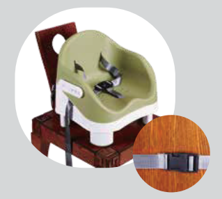
2. Place the booster onto a chair