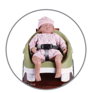
a. Place baby on the booster and fasten the seatbelt.