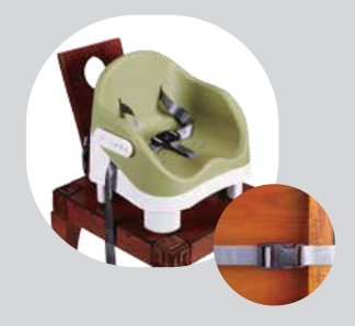
Fasten the belts onto the chair from the bottom and back of the chair. Ensure the belts are fastened properly, so the booster is not loose.